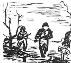
Normandy Beachhead and San Lo